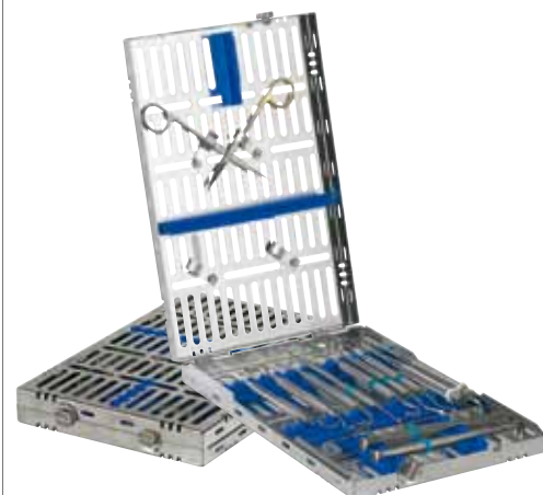
IMDIN13_S DIN Cassette for 18 Instruments