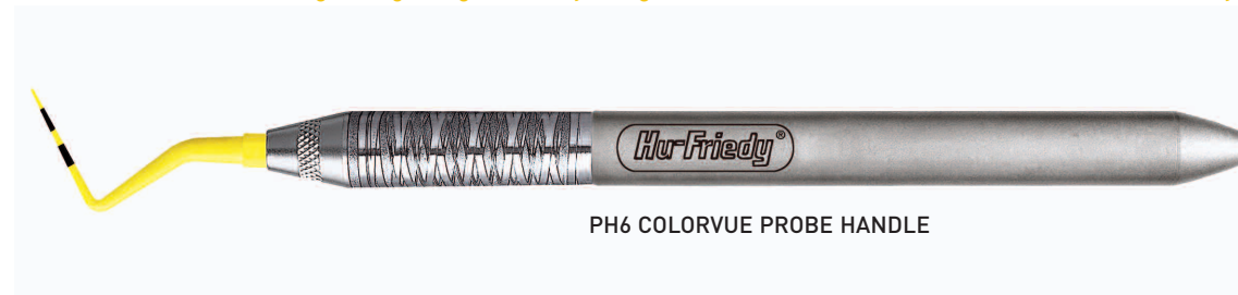
PH6 COLORVUE PROBE HANDLE

Colorvue Probes feature the lightweight ergonomically-designed Satin Steel® handle for the balance and control you prefer.